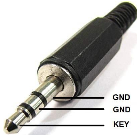
Straight keyer Jack (stereo)