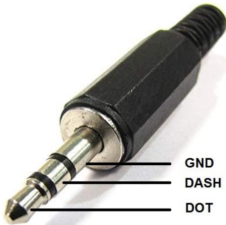
Paddles keyer Jack (stereo)